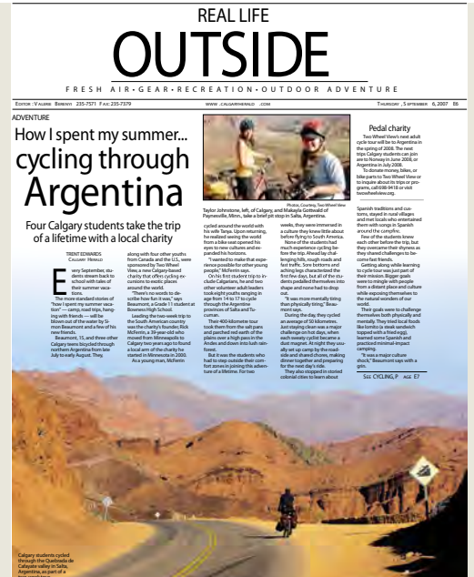
Material reprinted with the express permission of "Calgary Herald Group Inc.", a CanWest Partnership.

REGISTERED USA 501(C)(3) NONPROFIT | ©TWO WHEEL VIEW 2011 | REGISTERED CANADIAN CHARITY